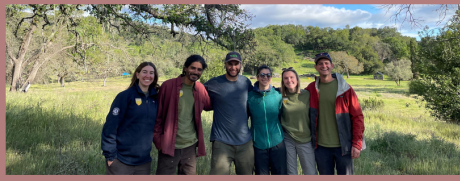
(Stinson Beach, CA) A group of Grizzlies recently attended a Basic Wildland Firefighter training with #FireForward at Audubon Canyon Ranch, which aims to a mobile unit of prescribed fire and understory thinning tools to be used as a shared resource across the state.