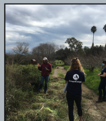
(Watsonville, CA) As a Community Supported Agriculture (CSA) Program, Live Earth Farm sustains deep relationships through food and care for the land. Fellows spent the day supporting projects that included invasive species removal, field preparing for hedgerows, and animal chores for Farm Discovery educational farm.