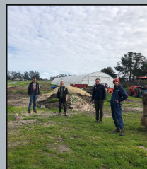
(Petaluma, CA) Live Oak Farm is a regenerative organic fruit and vegetable farm that has deep expertise on biodynamic planting and unique planting. Farmer William hosted our fellows for a tour of their facilities in addition to a compost & chip dressing on their trees.