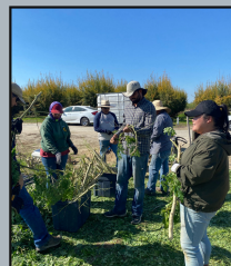
(Red Bluff, CA) Demonstration & volunteer day with Chico Traditional Ecological Knowledge. Fellows pulled mustard and helped clean up the showcase area at the site to prepare for planting. The Chico TEK crew gave demonstrations of native seed stock and shared essential practices grounded in TEK.