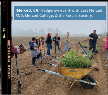
(Merced, CA) Hedgerow event with East Merced RCD, Merced College, & the Xerces Society.

| APPLICATION ANNOUNCEMENTS | | EVENT SPOTLIGHTS | | FELLOW UPDATES | GRIZZLY VOICES |